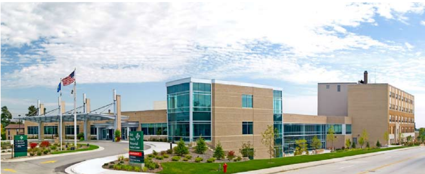
Holy Family Memorial Medical Center