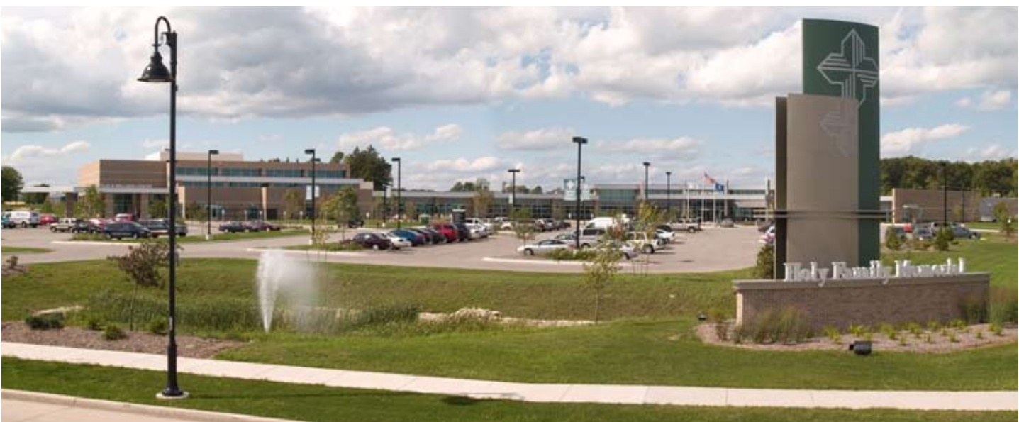
HFM Harbor Town Campus