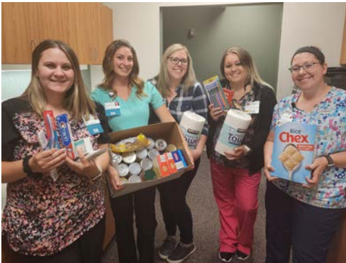
The 2023 Healthy Shelves Drive collected 680 food and hygiene items that were donated to Grow it Forward.

The Froedtert & the Medical College of Wisconsin health network integrates Corporate Social Responsibility practices and programs and volunteer opportunities through Froedtert in Action into our culture. Froedtert in Action, a Community Engagement initiative, reaffirms our organization’s commitment to give back to the diverse communities we serve. It reflects our commitment to our mission while creating excitement about the many ways we can give back as an organization. The program highlights volunteer opportunities available to staff, showcases the value of those community activities and demonstrates the impact of the work we do.