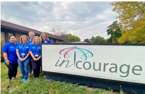
Staff volunteered throughout the year to support individuals and partner organizations, such as InCourage, by organizing yard clean-ups and completing service projects requested by organizations.