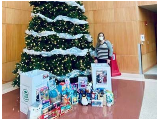
For the second year, Froedtert Holy Family Memorial partnered with Salvation Army to collect toys for their Toys for Tots Program. All Froedtert & the Medical College of Wisconsin sites in Manitowoc and Sheboygan counties participated, collecting 310 toys for children.