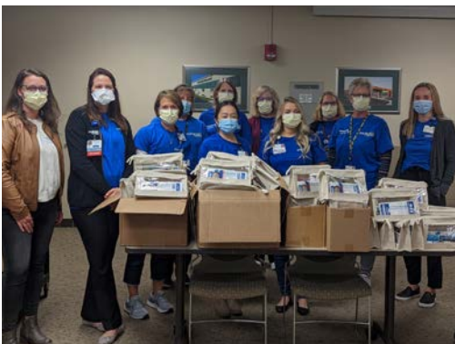
Twenty staff members filled 240 hygiene kits that were donated to local organizations as part of our annual United Way staff giving campaign.